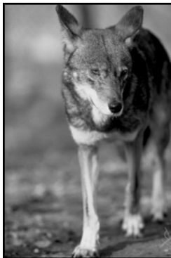
Steve Maslowski, USFWS

The preserve is also home to other protected species including the bald eagle, peregrine falcon, American alligator and red wolf. The preserve hosts more than 100 species of migratory birds and waterfowl. Bobcats, black bears, white-tailed deer and a wide variety of plant species also flourish at the preserve.